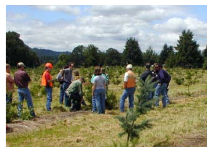
Figure 1. Annual meeting 2005 field trip to the miniaturized seed orchard at Plum Creek.

Glenn Howe recommended capturing data on damage from naturally occurring frost events in progeny tests, and testing at least a subset of families in second-generation tests.